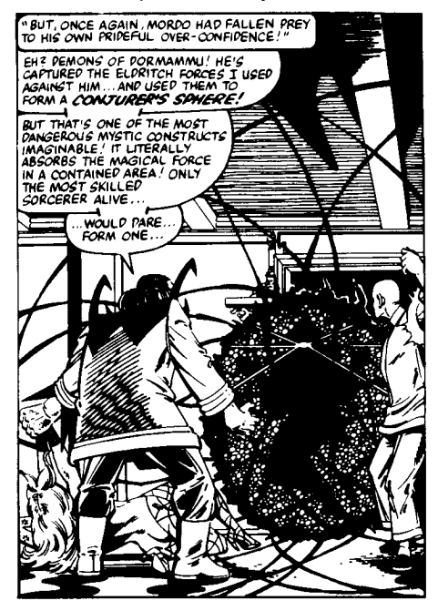
ing. If he qualifies, he may find a student of his own to teach. His studying of the writings of the ancient arts gleans him more information than any other source.

Master. The character possesses at least 12 spells. He has a spell rank of at least Excellent in all of them and Incredible or better in at least four of them. He spends very little time with his master, but much of it in contemplation, study, and adventur-